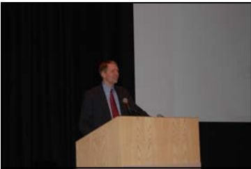
Ohio Attorney General, Richard Cordray answers a question following the AVP Report presentation.

Copies of the report are available online at www.co.summit.oh.us (click on Council tab)