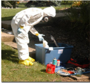
A Summit County Sheriff's official sorts through evidence at a Meth-lab site.