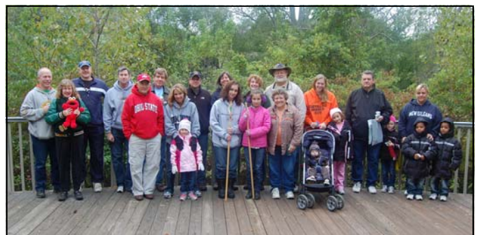
Top row from left — Zippy with twin hikers, sisters with Let’s Move winter beanie hats, Cool Rider with a hiker, Middle row — Grand Prize winner with YMCA staff, hikers visit Earth Fare table, Bottom row— a hiking group gets ready to hit the trail at Firestone Metro Park.